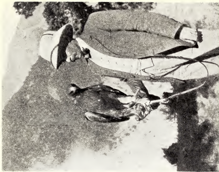
THE GOLDEN EAGLE ( Aquila chrysaëtus daphanea )

Destructive to hill game in Autumn and Winter.